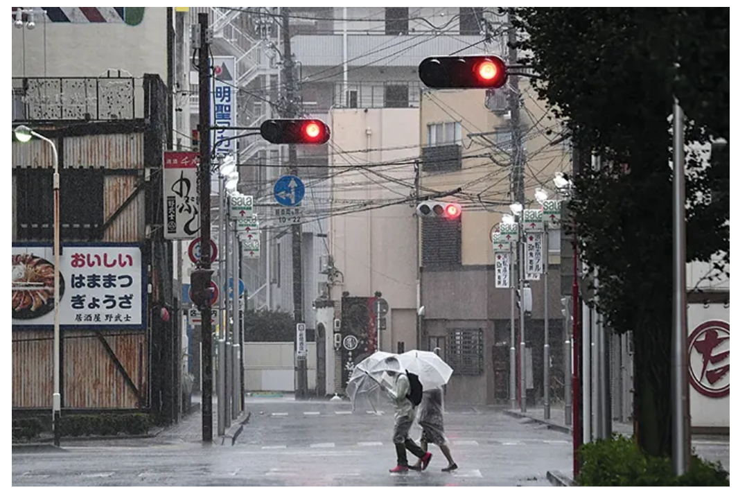
Typhoon Hagibis approaches Japan

The ethos and expectations behind emails telling staff to "bring sleeping bags and extra snacks" in case they were stranded at work by the typhoon are among a host of problems surrounding overwork, from companies banning long naps in office restrooms to the fact that 19 workers in their twenties fell victim last year to karoshi , or death by overwork (that is, stress-related ill health or suicide).