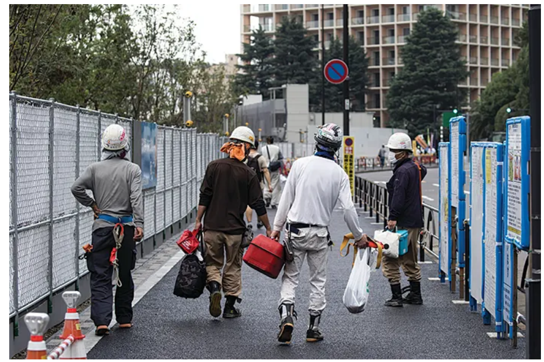
Construction workers in Tokyo building facilities for the 2020 Olympics So severe is the problem that the health ministry has introduced the concept of a " karoshi line" — a level of overwork past which a person is at serious risk of a potentially fatal illness such as a heart attack or cerebral haemorrhage. The threshold is defined as working overtime of more than 80 hours a month over a two- to six-month period.

In July last year, when torrential rains hit Hiroshima, Okayama and Ehime prefectures, some 2,768 local government workers were deemed to have been at risk of death by overwork because of their post-disaster efforts. The Building and Wood Workers' International federation of trade unions has asked organisers of the Tokyo 2020 Olympics to allow inspections to ensure construction work in preparation for the games does not push hundreds over the karoshi line.